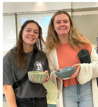
Two happy Chili Bowl attendees

First, the event started off with an incredible offer: a free bowl! Our talented studio mates crafted a wide variety of beautifully decorated bowls, to be included in the price of a ticket (only $20!). Choosing the perfect one was a challenge, but in the end, each attendee found their perfect bowl.